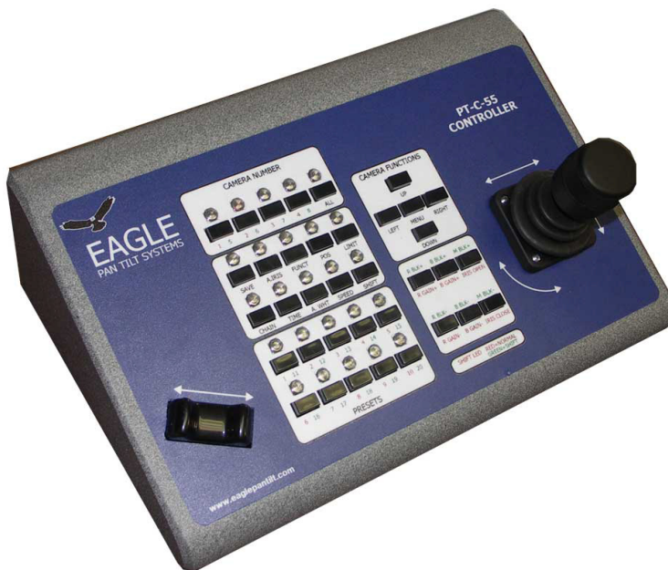
Eagle™ PT-C55 controller

The EAGLE® PT-C 55 pan-tilt controller is a low cost, easy to use unit. It is designed for usage with any Eagle™ pan-tilt head.